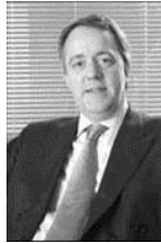
Private Sector Head Hunter