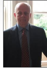
NHS Wales Health Strategy Unit